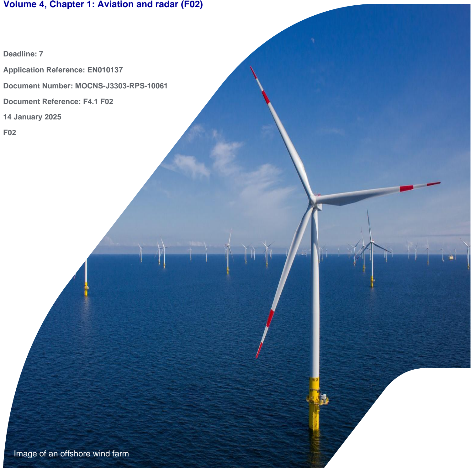
Image of an offshore wind farm